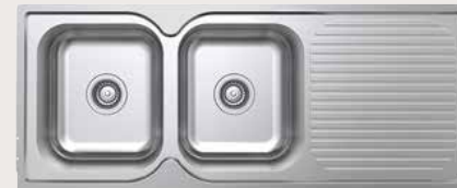
Double Bowl Sink With Drainer

A busy family Kitchen requires a hard-at-work sink. With an extensive range of generous sized bowl options designed to cater to most styles and needs, made to stand up to the rigour of daily use.