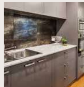
Formica® (soft closing) Doors and Panels