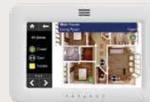
Paradox Touch Screen