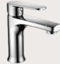
Argent Pace Basin Mixer