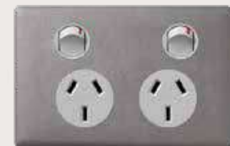
Urban Grey Power Point Coverplate + more colour choices