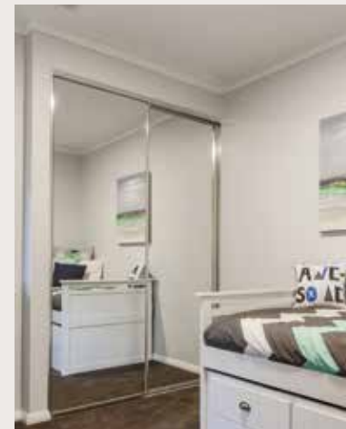
Mirror Sliding Robe