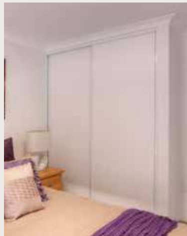
Vinyl Sliding Robe