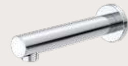
Caroma Pin Bath Outlet