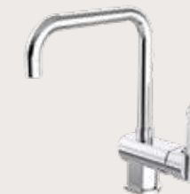
Caroma Saracom Sink Mixer