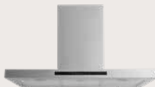
900mm Stainless Steel Canopy Rangehood