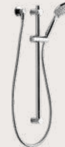
Argent Metro Shower Rail Set