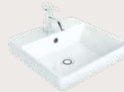
Caroma Carboni Seamless Inset Basin

Find the perfect style of basin for your Bathroom.