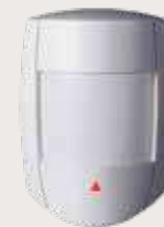
Paradox Alarm - Security has never been so simple