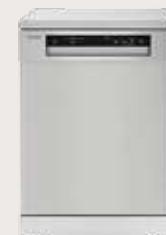
600mm Stainless Steel Freestanding Dishwasher