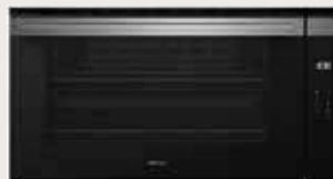
900mm Stainless Steel Built In Oven

Surround yourself with the sophistication and style of our most popular range.