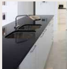
20mm Caesarstone® Bench Top