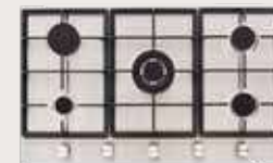
900mm Stainless Steel Gas Cooktop