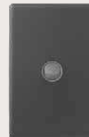
Urban Grey Light Switch