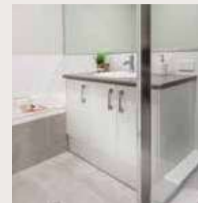
Formica® Bathroom and Laundry Bench Tops